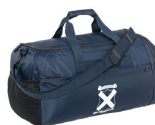
St Andrews College Sports Bag