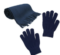
Gloves & Scarf Navy or Maroon