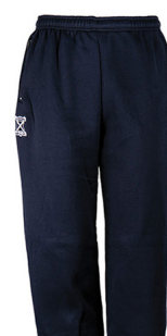
❹ Navy Track Pants