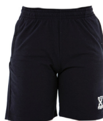
❼ Sport Shorts