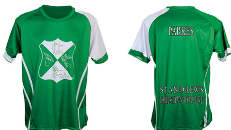
St Andrews PARKES House T-Shirt