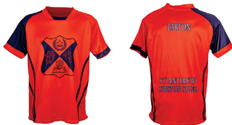
St Andrews BARTON House T-Shirt