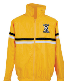
❽ Yellow Spray Jacket 'Yr P-6'