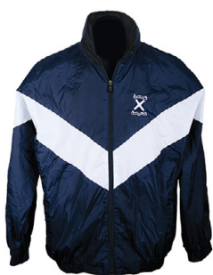
❶ Secondary Sport Jacket 'Yr 5-12'

• Year 5-6 students are allowed to wear either the Yellow Spray Jacket or the Secondary Sport Jacket.