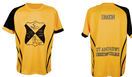
St Andrews DEAKIN House T-Shirt