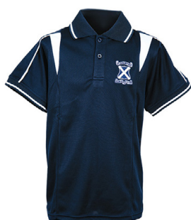
❷ Navy Polo