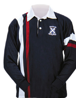
❸ Navy Rugby Top