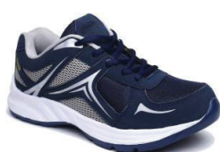
❻ Sports Joggers